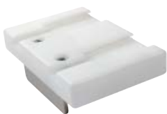
for 2 pressure transducers

to connect to the pressure transducer holders autoclavable