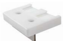
for 2 "BRAUN" pressure transducers